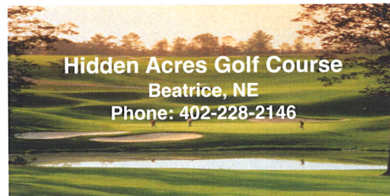
Hidden Acres Golf Course Beatrice, NE Phone: 402-228-2146

There were no recipients in 2016. (nominations are always welcomed)