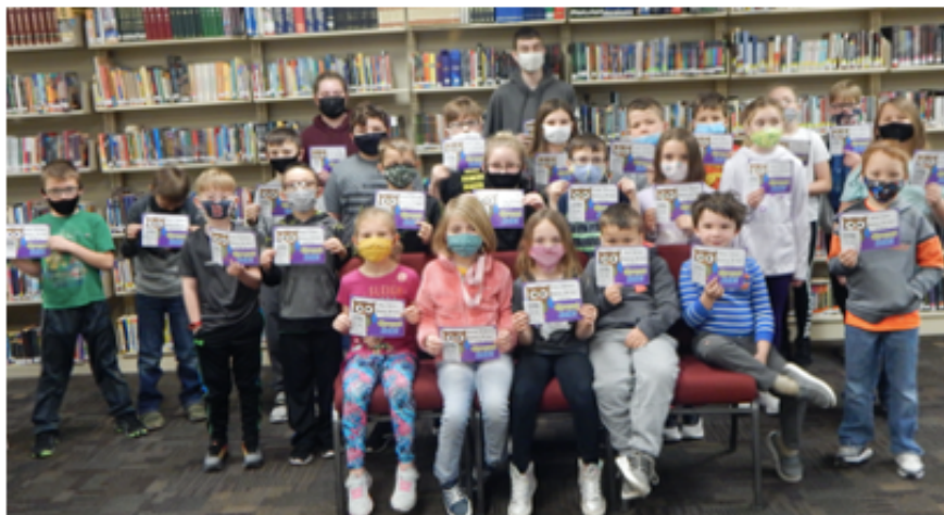
Lewiston Students Meet their AR Reading Goals