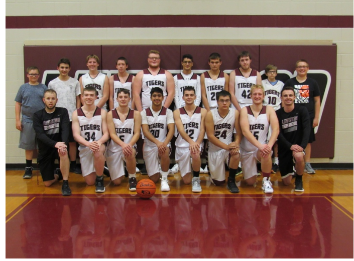
First Game is at home on Thursday, December 5th, 5:15 vs Friend