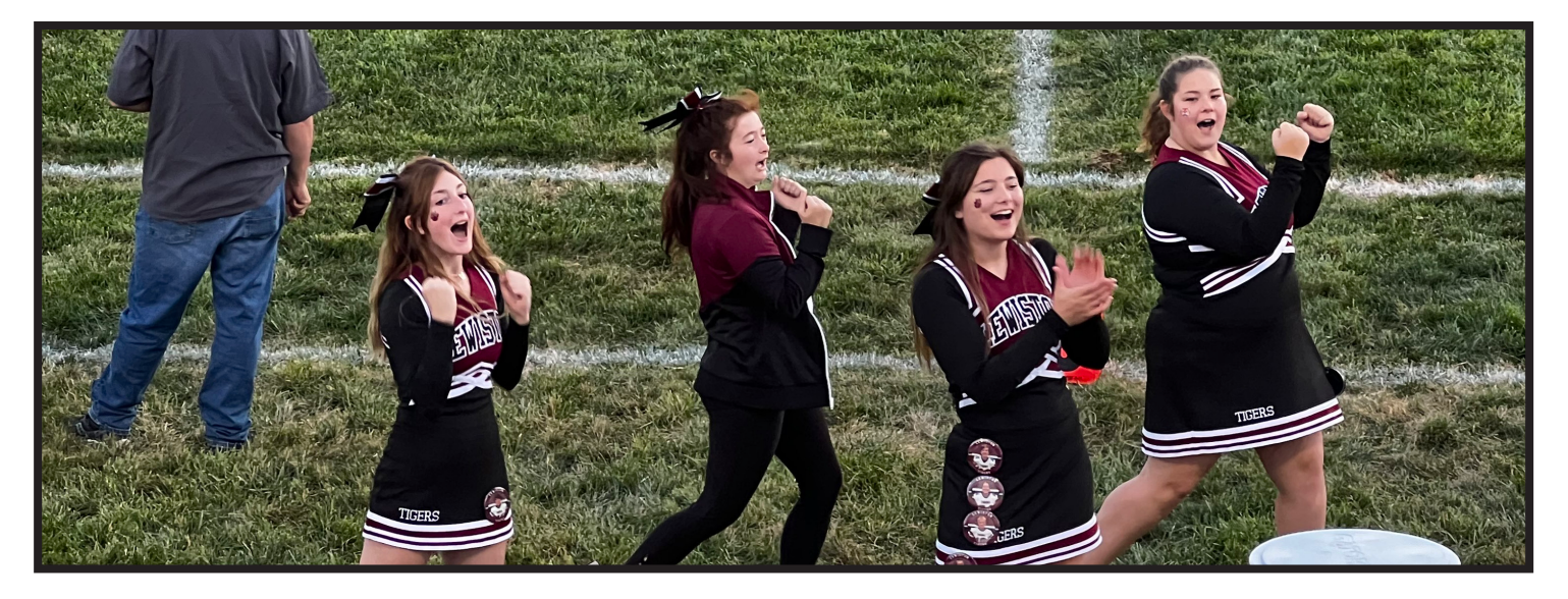
The Lewiston Cheerleaders Cheer for the first "home" football game vs. Wilcox-Hildreth