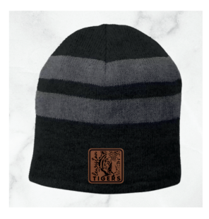
Unisex Patch Beanie Fleece Lined $10 (Item E)