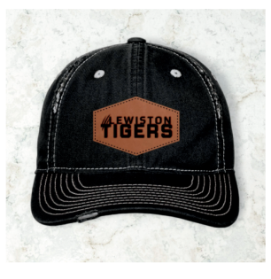
Tigers Patch Hat - Black $15 (Item C)