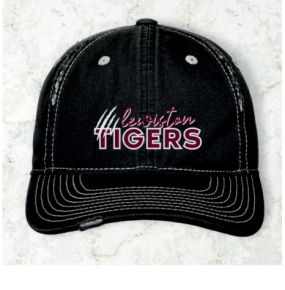
Tigers Logo Hat - Black $12 (Item B)