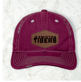
Tigers Patch Hat - Maroon $15 (Item D)