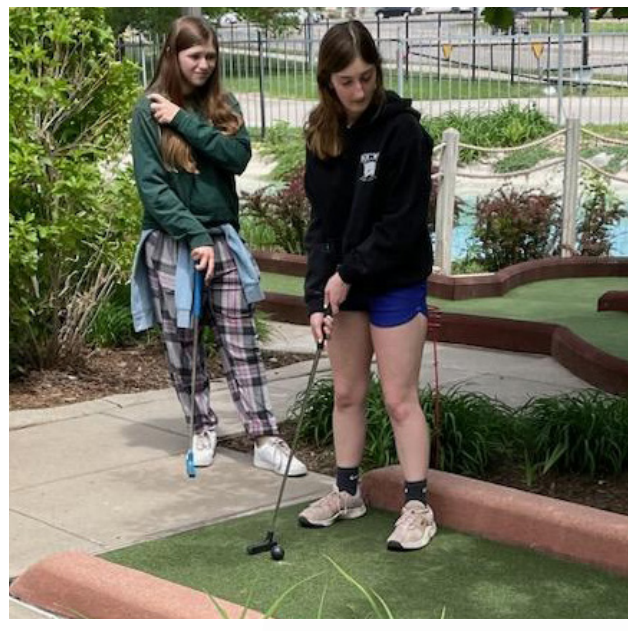
LCS (Leadership-Character-Service) members received a much deserved mini golf trip in May!