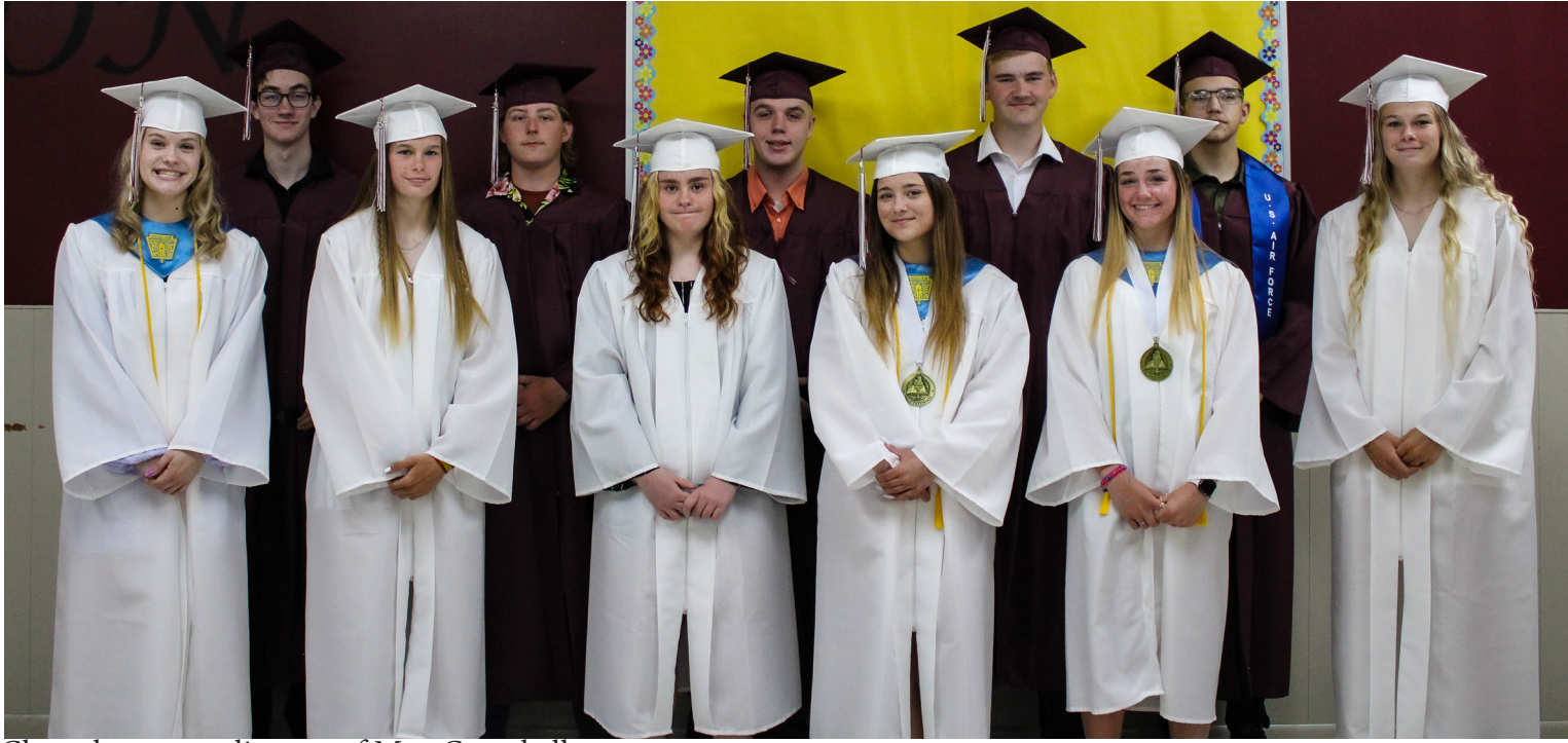
Class photo